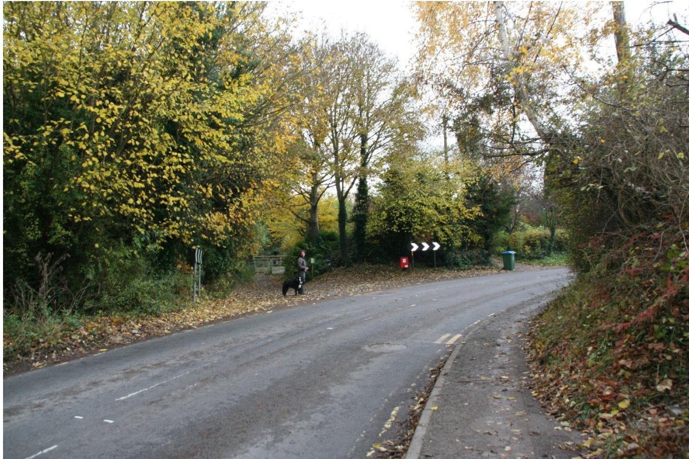
Current road crossing on Ellesborough road, with entrance to Bacombe Hill ahead.